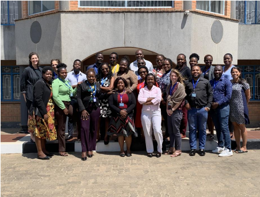
Regional Training Malawi, September 13, 2023